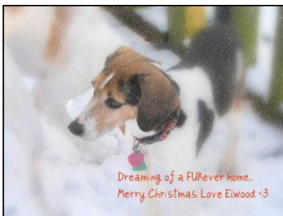
Dreaming of a FURever home. Merry Christmas Love Elwood <3