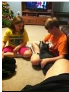
Sir Ean—Adopted 12/23/11

Want your picture to be here next month? Adopt your next family member from FURever Friends Humane Society, Inc.