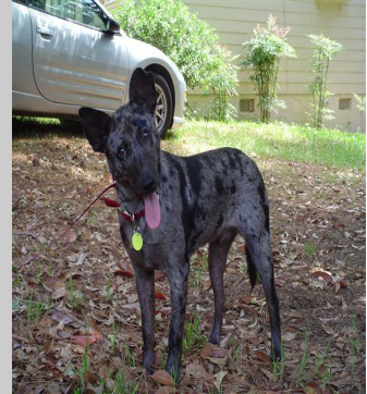
Merlin Adopted 2006

Why? Their owners failed to put identification on their animals. Even the most responsible pet owners can be accidentally or unexpectedly separated from their pets